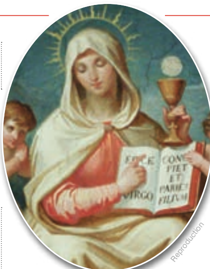
Our Lady of the Most Blessed Sacrament Basilica of Santa Maria Maggiore, Rome

Who other than She could have narrated to St. Luke the episodes of Jesus’ childhood recounted in his Gospel? And how many confidences did St. John receive from Her whom Christ on the Cross entrusted to his care? Mary is rightly called Mother of the Church, because from its very beginning She provide it with example, strength and instruction, and in Heaven She continues to exercise this mission to this day!