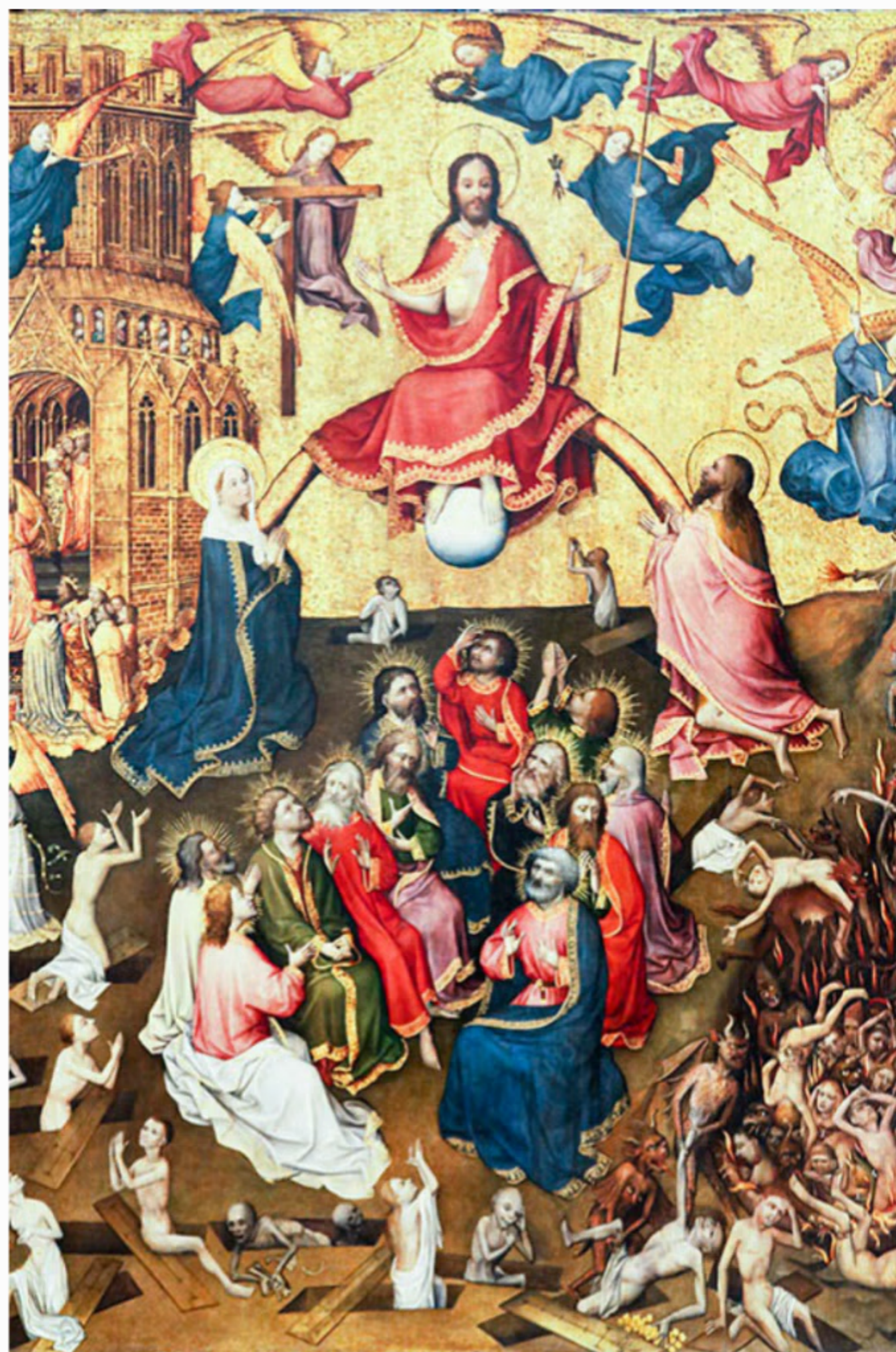
The Final Judgement – St. Mary Cathedral, Burgos (Spain)

Perhaps we would ask Him, “Are we then obliged to love Thee like this?” I am well aware that this precept of love is not a written one , but it does not need to be. It is not written, but everything proclaims it: this law is engraved in our hearts.